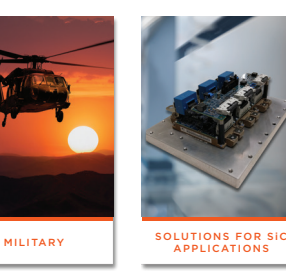
Mersen is your supplier of choice for power management solutions for various industries. Contact us at ep.mersen.com for more information.