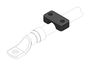
Cable Clamp Strain Relief