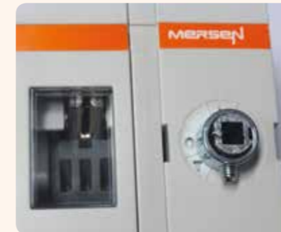
Safety: Window provides visible verification of position of switch.