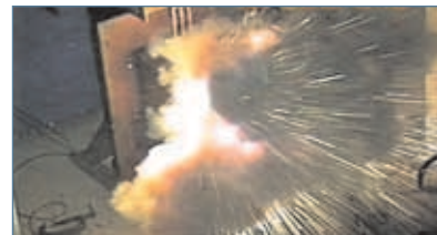
Arc Flash in test lab. Test conditions: 250V; 15,000A; 0.1 second clearing. Incident energy was measured to be 8.5 cal/cm 2 at 18".

The many hazards created by arcing faults in today's industrial power systems arise from two factors: the tremendous amounts of energy that can be delivered to such arcs and the workers' close proximity to them.