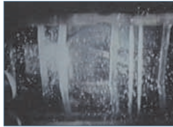
Energized bus bars, broken loose during a short circuit test pose a shock hazard

The force of the explosion can cause a significant amount of shrapnel to be accelerated away from the source. These fragments can impact a nearby worker at high velocity, resulting in physical trauma.