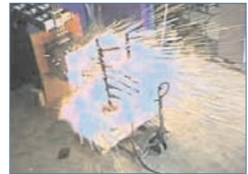
Molten metal shows as streaks on this video captured from a test lab video.

As the arcing fault develops, the magnetic fields created by the currents force the arcs away from the source until they reach a barrier or the end of the conductors. At high fault current levels, plasma jets are formed at these "electrodes". Hazards from vaporized and molten electrode material, ejected at high velocity from these jets, can extend for several feet. Since the molten metal is typically over 1000° C, it's a potential ignition source for conventional clothing.