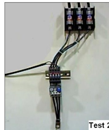
Figure 3. Test with AJT as overcurrent protection of IEC Starter for 22kA short circuit at 480V. Type 2 protection - NO DAMAGE.

The only allowable damage under Type 2 Coordination is light contact welding provided that the contacts are easily separable. See Figure 3 for an example of Type 2.