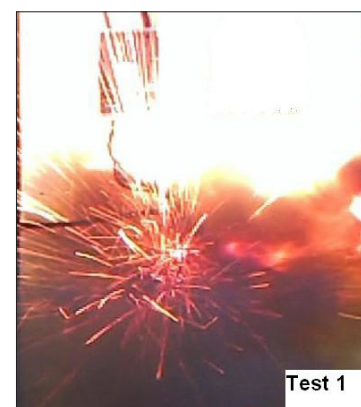
Figure 2. During test. Heater elements were vaporized and contacts solidly welded. Type 1 performance.

Type 1 Coordination ensures that the controller does not cause danger to persons or installation under short circuit conditions. However, the controller is not likely to be suitable for further services without repair and replacement of parts. Under test conditions defined in the standard, Type 1 damage may include vaporized heater elements and permanently welded contacts. Under actual conditions, Type 1 damage may require that a new starter be obtained and installed after repair to the control panel is completed. See Figure 2 for an example of Type 1 performance.