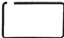
Handle Tie 23936-G