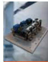
SOLUTIONS FOR SiC APPLICATIONS

Mersen is your supplier of choice for power management solutions for various industries. Contact us at ep.mersen.com for more information.