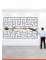
DESIGN • SIMULATIONS • TESTING •