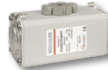
SEMICONDUCTOR PROTECTION FUSES