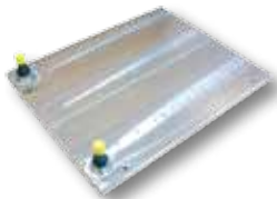
LIQUID COOLED AQUAMAX® VACUUM BRAZED ALUMINUM HEATSINK

All Mersen laminated bus bars models are optimally designed to minimize unwanted "skin effect" resulting from high switching nature of Silicon Carbide (SiC) applications. Mersen's dedicated teams of application engineers work closely with our customers from the very early design stages to create the optimum cooling and bus bars solutions to effectively reduce system weight and increase efficiency. Mersen's photovoltaic (PV) fuse series was engineered and designed specifically for the protection of photovoltaic systems. Its enhanced fuse construction makes it ideal for continuous temperature and current cycling withstand adding to system longevity. Here are some examples of our solutions: