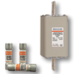
HP10M PHOTOVOLTAIC (PV) FUSE SERIES AND HP15NH3L PV FUSE SERIES