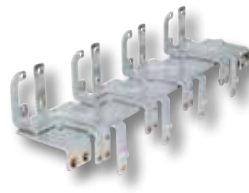
ALTERNATE FUEL SYSTEMS BUS BAR: FUEL CELLS AND HYBRID ELECTRIC VEHICLES REQUIRE RUGGED, RELIABLE POWER DISTRIBUTION